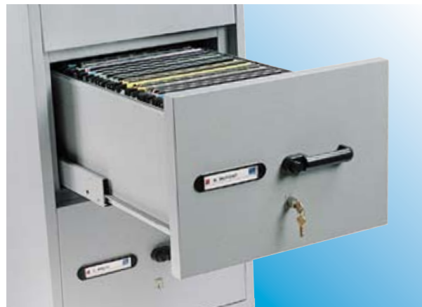
The CRP 42 4-drawer insulated safe is specifically designed to store and protect your important paper documents from fire.

CRP 42 filing cabinets, available with two, three or four drawers, are constructed to store almost every model of file on the market. The cabinets have been designed for stability, even when all the drawers are completely full. CRP 42 offers excellent fire protection for your documents and since the drawers are built as independent units, one open drawer will not expose the remaining drawers to fire.